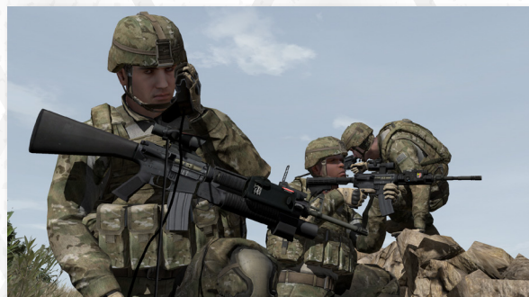
3D directional voice capability