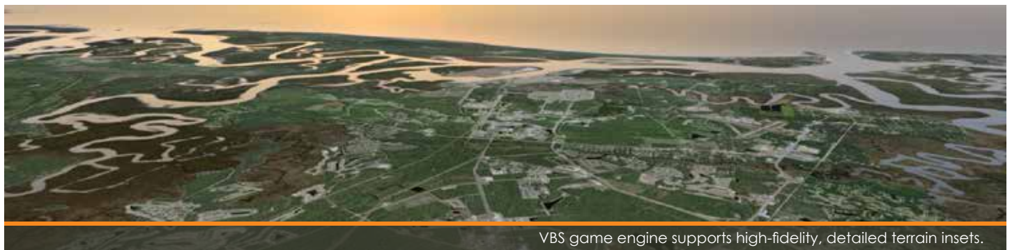
VBS game engine supports high-fidelity, detailed terrain insets.