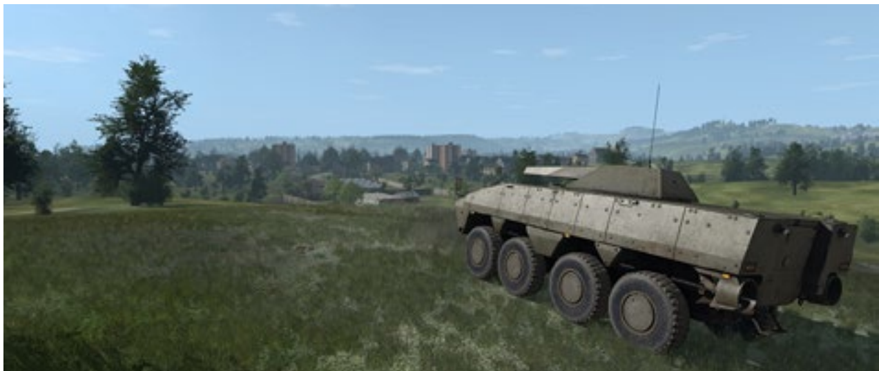
Caption: A model of the AMV Nemo in VBS3 is picture above. The Finnish Defence Force acquired an enterprise licence of VBS3 for training across all branches.

As part of the delivery, BISim will provide FDF with the new soft licensing system known as WIBU CodeMeter, replacing the previous HASP system. WIBU allows a secure and easy way to distribute and update software licenses, effectively allowing FDF to control its own licensing. The new system, available for other military customers at the beginning of 2017, significantly reduces