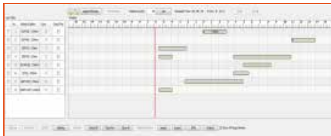
Fire Schedule Worksheet

All projectiles in VBS3Fires are simulated from barrel to impact. There is a detailed, customisable exterior ballistics simulation that considers, projectile size, shape, drag, speed, altitude; air temperature, density, wind as well as the effect of earth spin and latitude. The terminal effects model is effected by angle of impact, projectile type, fuse function, height of burst, and terrain.