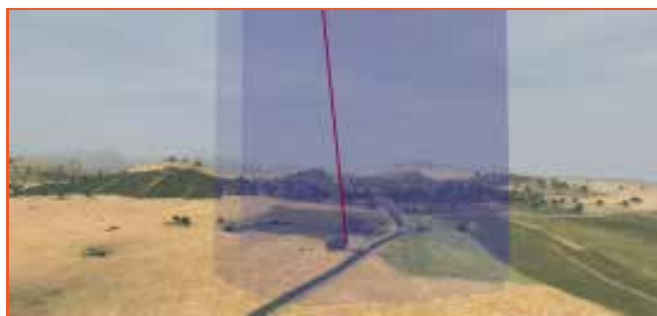
Fire Support Coordinating Measures

One of the major advances in VBS3Fires is the Fire Planning capability. VBS3Fires allows a user to generate a Fire Plan, to execute that Fire Plan and also to modify the Fire Plan during execution. This is supported by an intuitive time-line based user interface. Fire Planning can be done in conjunction with the use of the many Fire Support Coordination Measures (FSCMs) available in VBS3Fires.