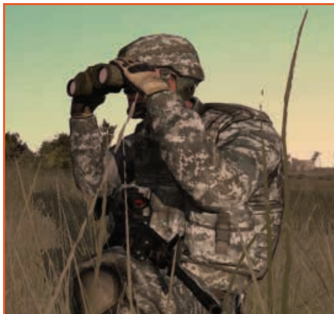
Target designation by Forward Observer