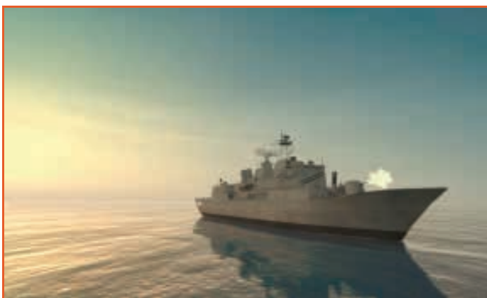
Naval Gunfire Support

When conducting Instructor-led training, there are also a number of options for Instructor-Trainee communication. VBS3 CFF related user interfaces allow the trainee to enter and transmit their CFF to the Instructor, alternatively, this can be done through voice or VOIP to maximise the trainee immersion.