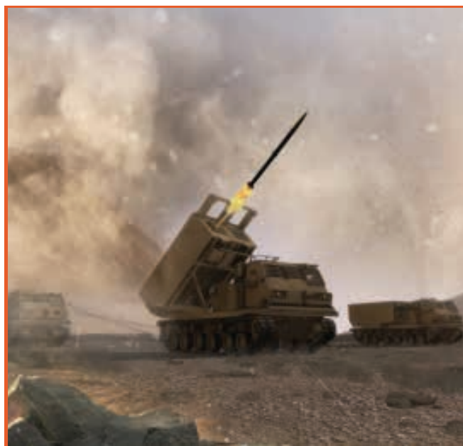
Artificially intelligent gun lines can respond to call-for-fire