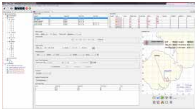
Instructor Control for Fire Missions

VBS3Fires complements the VBS3 After Action Review (AAR). As well as all standard information captured by the VBS3 AAR, VBS3Fires captures projectile paths, FSCM information, radio traffic, recorded targets, and call-for-fire. This can all be played back and visualised in the VBS3 environment.