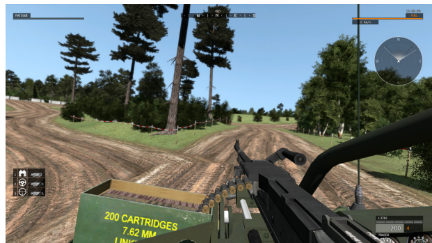
VBS3 enabled SNIY to work on both individual and collective training