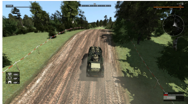
SNIY used VBS3's Jackal LAV to train virtual on TTPs

The SNIY combined virtual simulation with theory to achieve a complete training package and broaden the scope of training. Virtual training "allows you to do things you can't do regularly in live training like having an operation with artillery or close air support. We can't replicate that on a regular training night," says Captain Gregor Deeming of the SNIY's E Squadron. "It's a very good complement to live field training and for reservists with limited time."