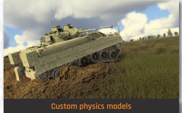
Custom physics models

Build and launch complex simulations faster - discover VBS Builder Edition today!