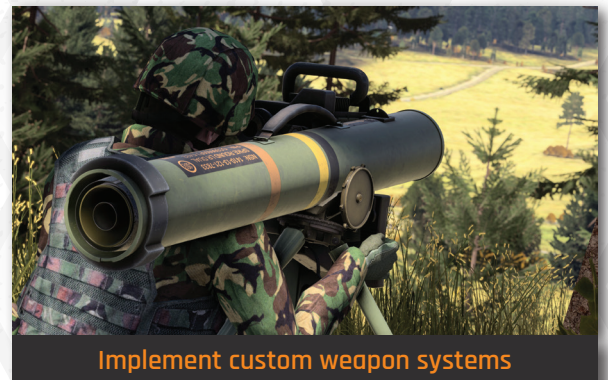
Implement custom weapon systems